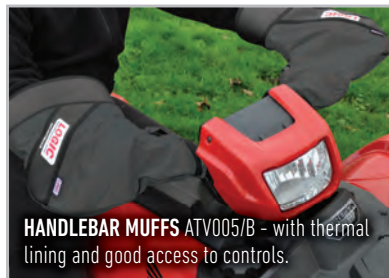
HANDLEBAR MUFFS ATV005/B - with thermal lining and good access to controls.