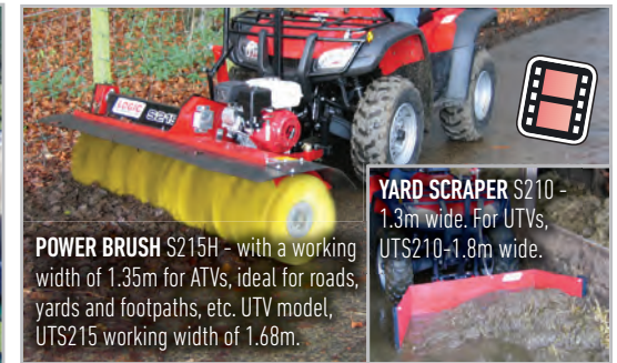
POWER BRUSH S215H - with a working width of 1.35m for ATVs, ideal for roads, yards and footpaths, etc. UTV model, UTS215 working width of 1.68m.