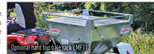
Optional hard top bale rack LMF112.

Ground clearance is important and is the same as a trailer, with no components below axle height that could be damaged by rocks, mud and snow.