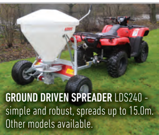
GROUND DRIVEN SPREADER LDS240 - simple and robust, spreads up to 15.0m. Other models available.