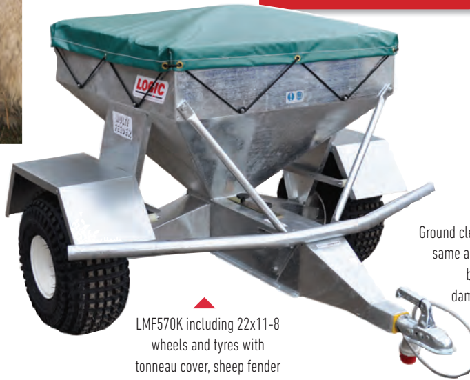
LMF570K including 22x11-8 wheels and tyres with tonneau cover, sheep fender and mudguards.