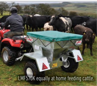
LMF570K equally at home feeding cattle.