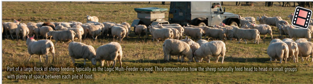
Part of a large flock of sheep feeding typically as the Logic Multi-Feeder is used. This demonstrates how the sheep naturally feed head to head in small groups with plenty of space between each pile of food.