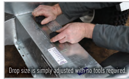
Drop size is simply adjusted with no tools required.

Once the calibration has been completed, which takes about 5 minutes, the operator knows how much is being dropped in each pile. Thereafter the drop counter will record how many drops have been given in any one batch to calculate the total amount fed. After that it is a question of maintaining a forward speed that will give the required spacing between heaps to suit the type of livestock being fed.