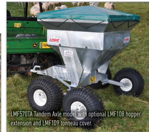
LMF570TA Tandem Axle model with optional LMF108 hopper extension and LMF109 tonneau cover.

Designed and manufactured in the UK to provide top quality equipment at outstanding value for money