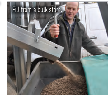
Fill from a bulk store.

Once the calibration has been completed, which takes about 5 minutes, the operator knows how much is being dropped in each pile. Thereafter the drop counter will record how many drops have been given in any one batch to calculate the total amount fed. After that it is a question of maintaining a forward speed that will give the required spacing between heaps to suit the type of livestock being fed.