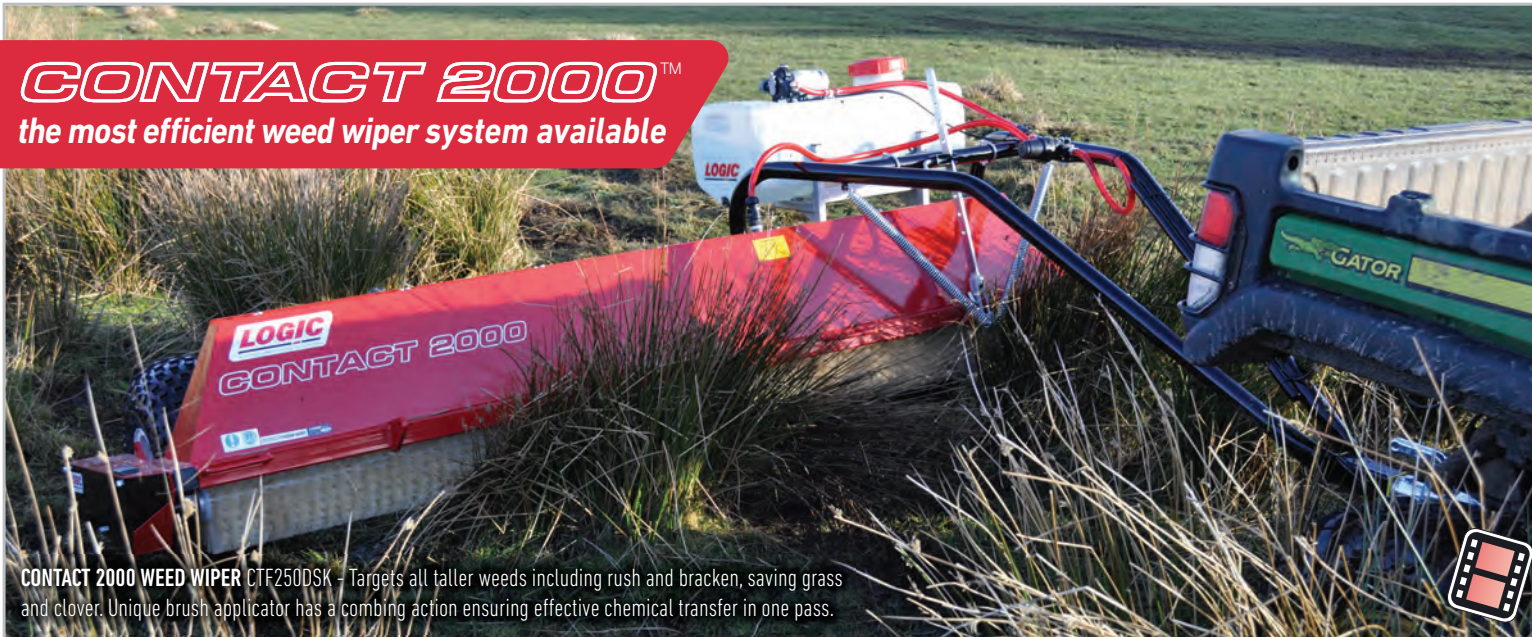
CONTACT 2000 WEED WIPER CTF250DSK - Targets all taller weeds including rush and bracken, saving grass and clover. Unique brush applicator has a combing action ensuring effective chemical transfer in one pass.