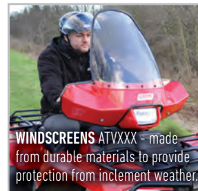
WINDSCREENS ATVXXX - made from durable materials to provide protection from inclement weather.