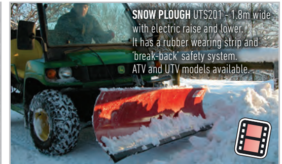
SNOW PLOUGH UTS201 - 1.8m wide with electric raise and lower. It has a rubber wearing strip and 'break-back' safety system. ATV and UTV models available.