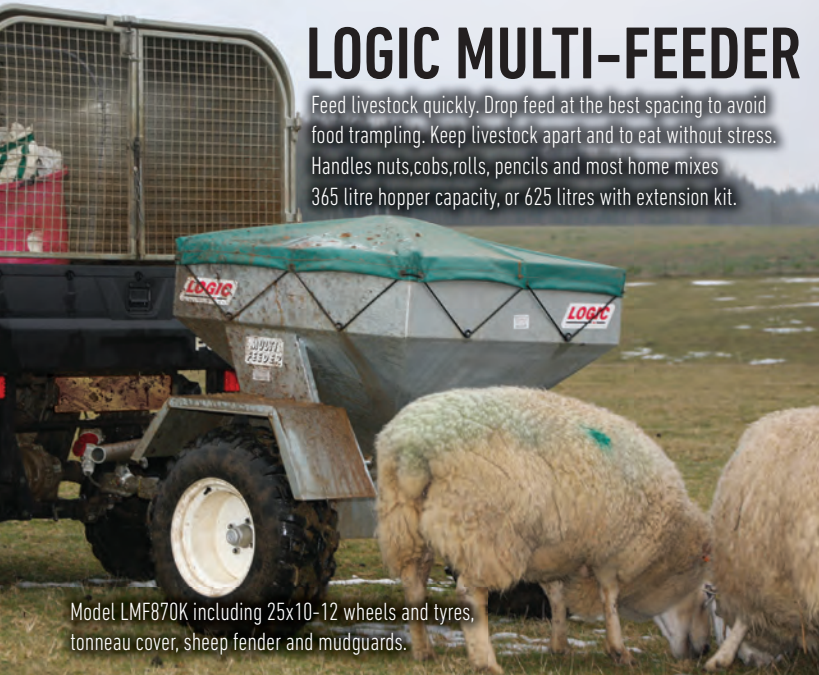
Model LMF870K including 25x10-12 wheels and tyres, tonneau cover, sheep fender and mudguards.

Feed livestock quickly. Drop feed at the best spacing to avoid food trampling. Keep livestock apart and to eat without stress. Handles nuts, cobs, rolls, pencils and most home mixes. 365 litre hopper capacity, or 625 litres with extension kit.