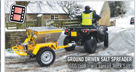
GROUND DRIVEN SALT SPREADER GDS150R - will spread 'Rock Salt'.