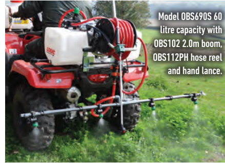
Model OBS690S 60 litre capacity with OBS102 2.0m boom, OBS112PH hose reel and hand lance.

There is a wide model range powered by the host vehicle's 12v electrical system, with capacities, hand lances and booms to suit every situation. Contact a Logic dealer or one of our offices for more advice.