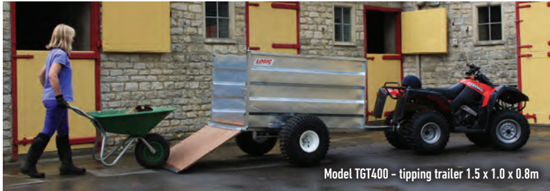
Model TGT400 - tipping trailer 1.5 x 1.0 x 0.8m

Trailers are a simple but important tool for any busy equestrian. The amount of time and hard work saved with the use of a suitable trailer can be tremendous. Logic has a range of models to cover most requirements and sizes to go behind any suitable vehicle with a 50mm tow ball.