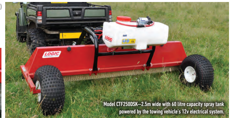
Model CTF250DSK—2.5m wide with 60 litre capacity spray tank powered by the towing vehicle's 12v electrical system.

Deck mounted sprayers are easy to mount into a UTV to provide a large 270 litre capacity, with in cab controls.