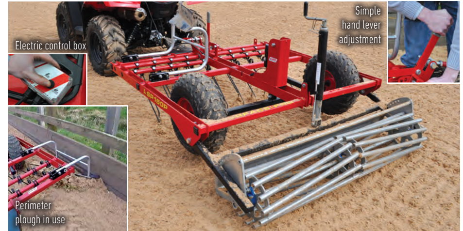
Electric control box

'Surface-Pro' with electric raise and lower, is an easy to use conditioner to level and compact to the firmness required for your riding discipline, including on the latest wax composite surfaces.