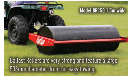
Model BR150 1.5m wide

Ballast Rollers are perfect for levelling soft ground or for use after reseeding worn areas.