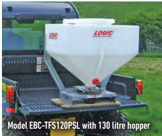
Model EBC-TFS120PSL with 130 litre hopper