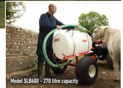
Model SLB400 - 270 litre capacity

Logic Bowers feature a strong chassis and mounting frame fitted with top quality low ground pressure wheels and tyres, suitable for soft ground. They have a large diameter ventilated lid for easy filling and a swivel hitch for added safety.