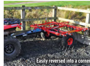
Easily reversed into a corner

The Logic Super-Harrow provides superior harrowing on all surfaces. The frame incorporates a 12v ram, which means the implement can be raised and lowered easily to regulate the pressure on the tines for delicate surfaces and when reversing into corners or transporting to storage. Its unique 'float' mechanism allows the harrow to work effectively on uneven ground. The tines are adjustable so that you can fine tune the harrow to perform different tasks, eg. simple harrowing through to re-grading gallops.