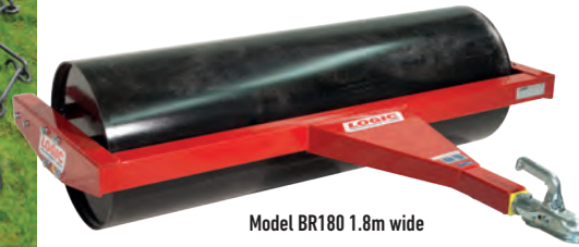
Model BR180 1.8m wide

Ballast Rollers are very strong and feature a large 508mm diameter drum for easy towing.