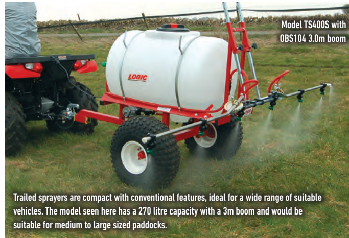
Model TS400S with OBS104 3.0m boom

Trailed sprayers are compact with conventional features, ideal for a wide range of suitable vehicles. The model seen here has a 270 litre capacity with a 3m boom and would be suitable for medium to large sized paddocks.