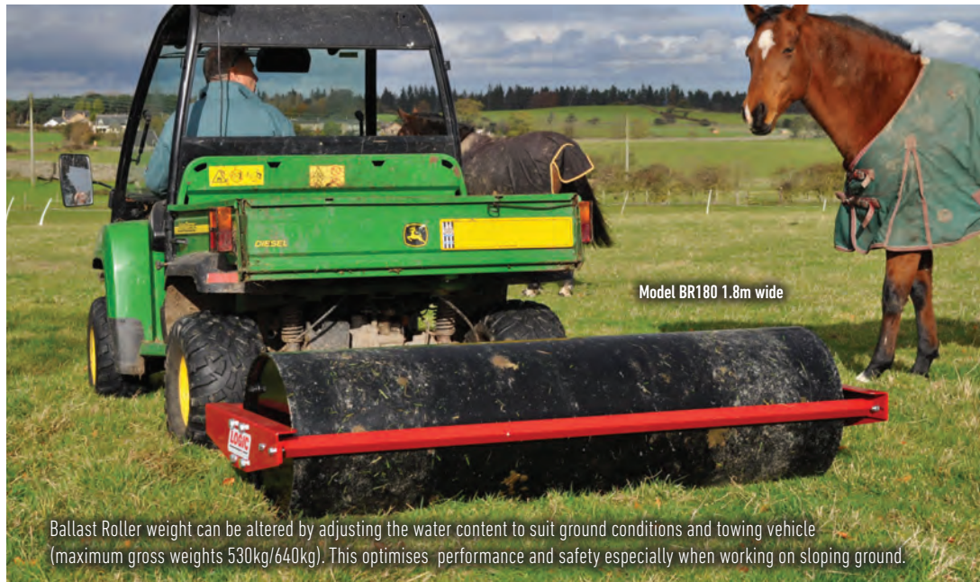
Model BR180 1.8m wide

Ballast Roller weight can be altered by adjusting the water content to suit ground conditions and towing vehicle (maximum gross weights 530kg/640kg). This optimises performance and safety especially when working on sloping ground.