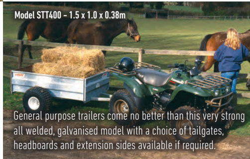
Model STT400 - 1.5 x 1.0 x 0.38m

Using this trailer to transport bales to a field is a one-person job and takes minimum effort thanks to the unique double pivot system, manual winch and sturdy straps.