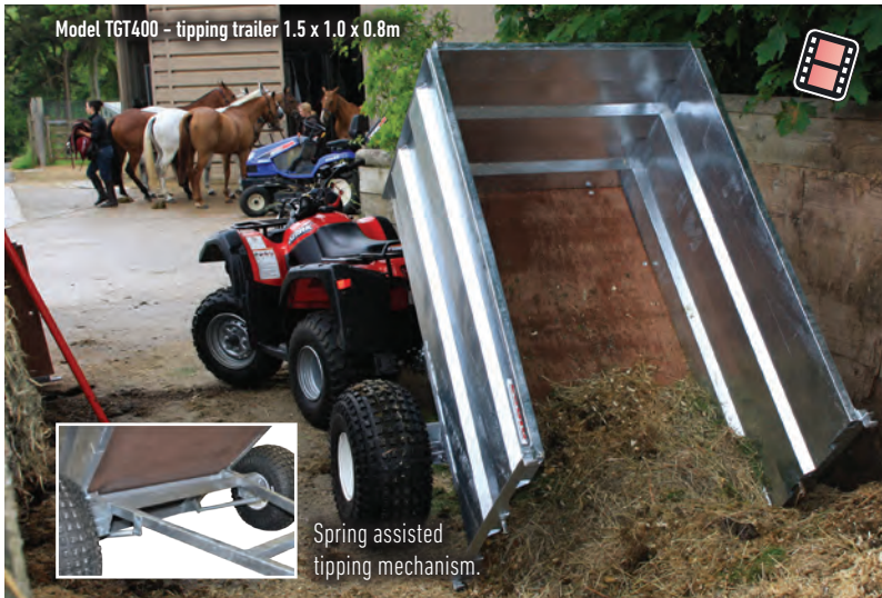
Model TGT400 - tipping trailer 1.5 x 1.0 x 0.8m