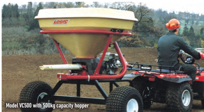
Model VC500 with 500kg capacity hopper

Engine Driven Spreaders are designed for soft ground or when no tractor is available. The hopper can be filled to suit the towing vehicle.