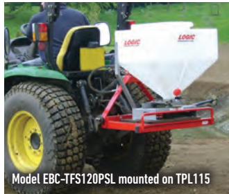
Model EBC-TFS120PSL mounted on TPL115

Engine Driven Spreaders are designed for soft ground or when no tractor is available. The hopper can be filled to suit the towing vehicle.