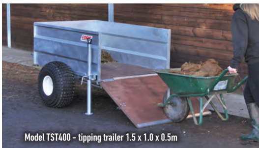
Model TST400 - tipping trailer 1.5 x 1.0 x 0.5m

Logic tipping trailers are tapered to ensure the load empties easily. The tailgate doubles as a loading ramp for wheelbarrows, etc. and the body is spring loaded to help tipping. The model (left) has optional prop stands and jockey wheel fitted.