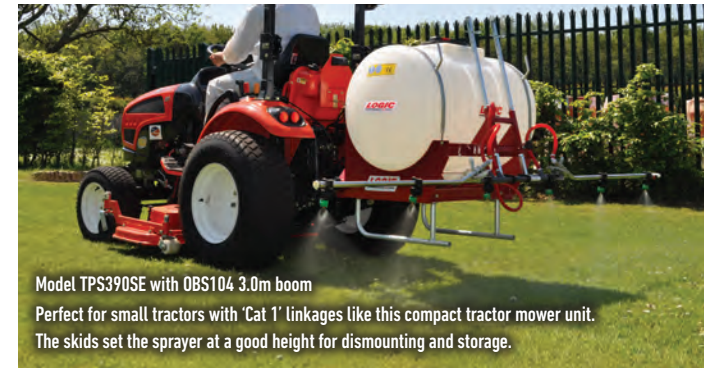
Model TPS390SE with OBS104 3.0m boom Perfect for small tractors with 'Cat 1' linkages like this compact tractor mower unit. The skids set the sprayer at a good height for dismantling and storage.