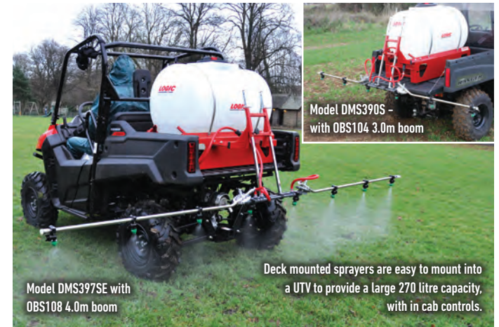
Model DMS397SE with OBS108 4.0m boom